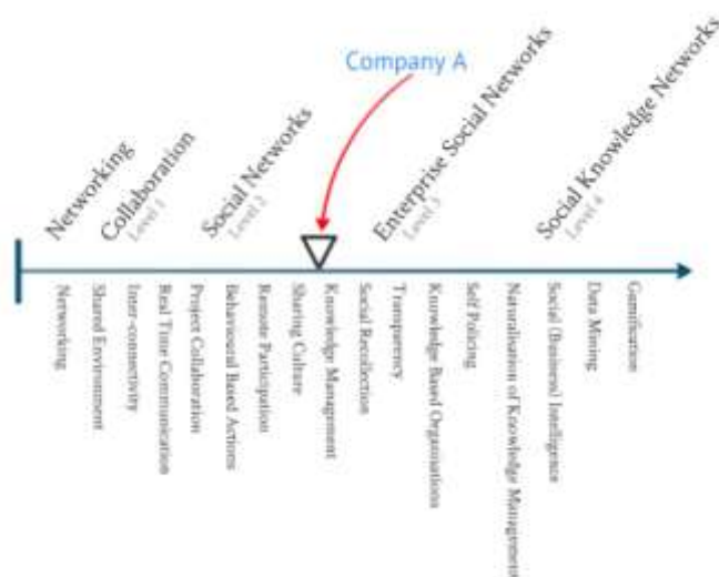
Figure 3: Position of company A on the OSN knowledge spectrum

Finally a link is highlighted that describes the relationship between a social network and proficiency of use and the age of the individual. The older an individual is the less proficient he or she is at using such technologies and vice versa. This is an expected result among the general population. The reaffirmation here highlights that more awareness of the OSN technology should be made to those who may not be as familiar with the technology and provide more care and attention. Without this care and attention the implementation process could run in to some issues reducing its capability to show increased performance or perhaps lead to its rejection. Perhaps Company A chose this project site due to its relatively young team members and as a result has proved implementation success over a relatively short period.