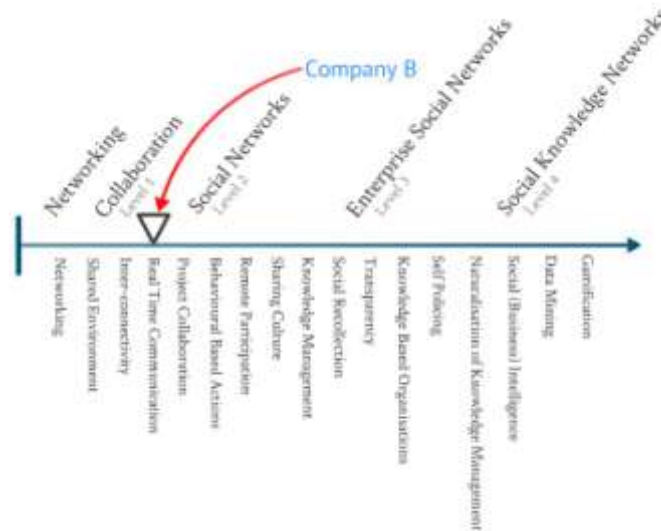
Figure 4: Position of company B on the OSN knowledge spectrum

There is a link made by the interviewee where due to the young age of the team and their previous familiarity with open OSNs the process of implementation was smoother. Inferring that OSNs are best used by younger as opposed to older individuals. Figure 4 finds company B located to the lower end of the spectrum due to the nature by which they are using the technology.