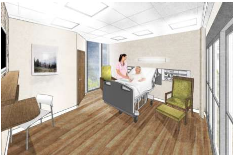
Figure 2: power point image of patient bedroom

Figure 2 is a power point slide of a patient bedroom, providing a more visual and aesthetic image of the bedroom that gives a better idea of space and visibility issues (as specified in the written project requirements). Whilst slides give more visual detail for client stakeholders to relate to, they also have the capacity to be interpreted in multiple ways.