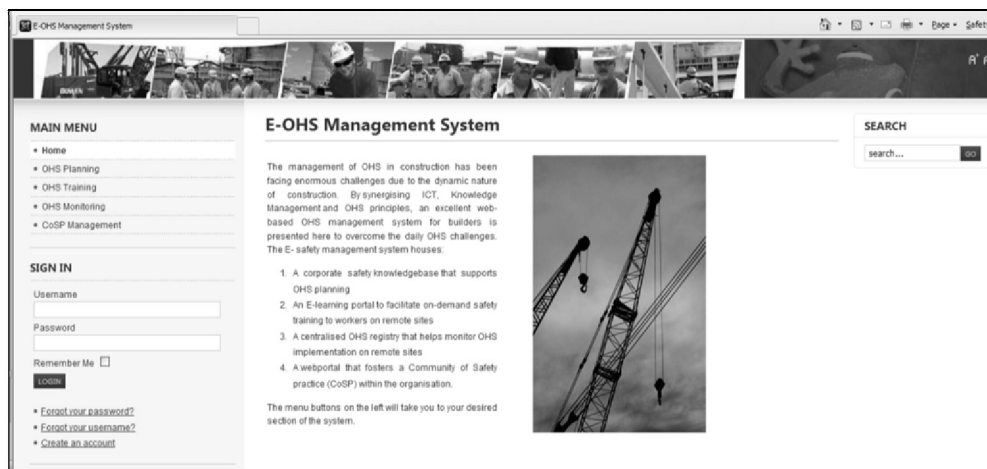
Figure3: Website front-end

A Joomla website has two parts: a front-end and a back-end. The front-end is that part of the website that is visible to users. The back-end is the administration area where the website is set-up, modified and managed. At the back-end, Joomla stores website contents in articles, which may contain written information, graphics and/or footages that are added to the webpage. Articles are organized in a hierarchy of sections and categories within the website. An article must belong to a section and a category simultaneously. It is important that initial sections and categories for the website are planned and created before adding contents (articles) for individual pages on the website. Another important element in Joomla is menu manager, which helps create navigational menus for the website.