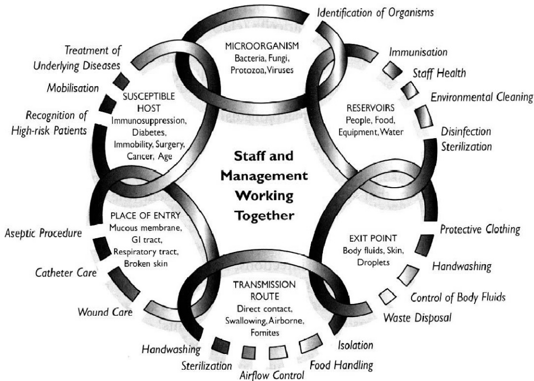
Figure 2: The chain of infection can be broken (Rural Infection Control Practice Group Victoria 2005)

heating and ventilation requirements. Negative pressure room is required in preventive isolation and positive pressure room in case of protective isolation (Rural Infection Control Practice Group Victoria 2002). If facilities are properly provided, containment of infection risk will be more effective in ‘isolation’ practices. In hospitals, FM department is very instrumental in the maintenance of ventilation equipments which could be a source of infection if not properly maintained. Figure 2 simply shows that breaking the chain of infection in healthcare setting require the working together of professionals, including staff and management.