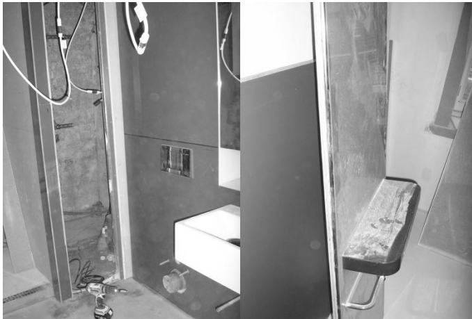
Figure 4: Pre-finished 'kit' panels being installed on site.

Many of the trades involved will require more than one visit and separate snagging works. Snagging can be particularly challenging for site management in both the interface co-ordination of the trades and when undertaken snagging and defect correction works. The standardisation of sanitary ware, fixtures and fittings are a possible means of reducing the overall capital costs through the careful modelling of standardised platforms with mass-customised configuration options to create the bespoke aesthetic designs required by the interior designers.