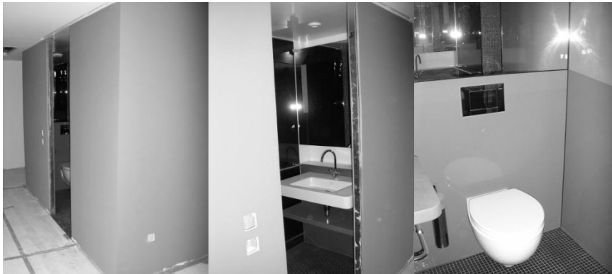
Figure 13: In-situ view of pod without glass sliding door

Figure 3 shows the mechanical and electrical service access points behind the pods. Each service riser allowed access to the SVP's, hot and cold supply manifold, lighting and electrical distribution hub with control systems. A modular wiring system was adopted to improve site installation of the complex electrical installation for lighting and the AV equipment. The position of a primary structural column created a number of restrictive access issues for the installation operatives. It is essential that this type of structural clash is considered at an early stage in order to minimise disruption and unnecessary delays during construction.