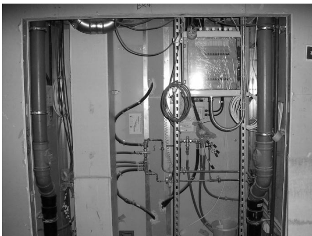
Figure 14: Mechanical and electrical services riser.

Figure 4 shows the pre-engineered bathroom 'kits' being installed. Each panel was delivered as a pre-finished element complete with the provision of pre-drilled holes for the connection of the various fixtures required. An integrated plumbing system was and modular wiring system was specified. These kits were required to interface with traditional construction materials and processes.