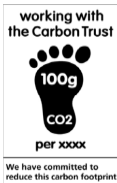
Figure 2. Carbon Footprint Label, (Sinden, 2009)

Carbon footprinting has been around for many years, recent work by Finkbeiner (2009) presents a good account of the current developments in Carbon footprinting, but it is only in the last three years that Carbon footprinting has become a marketing tool alongside the environmental benefits associated with it. The Carbon Trust has developed the publicly available specification (PAS 2050) and has been working with a number of leading organisations in the UK to implement this methodology into (primarily) consumer facing brands. Figure 2 shows the standard Carbon Footprinting label that accompanies many products, whilst this information is useful it does appear simplistic and no indication is given against an 'average'.