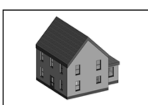
Case study 3 results