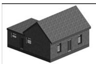
Case study 1 results