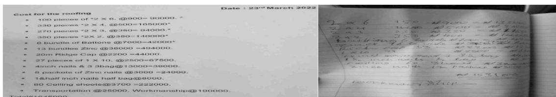
Figure 2: Estimates from carpenter-01 and carpenter-02 for the roof

This illustrates that the roof sketch facilitated negotiations without clearly written agreements and mode of payment for carpenter-01 to install the roof.