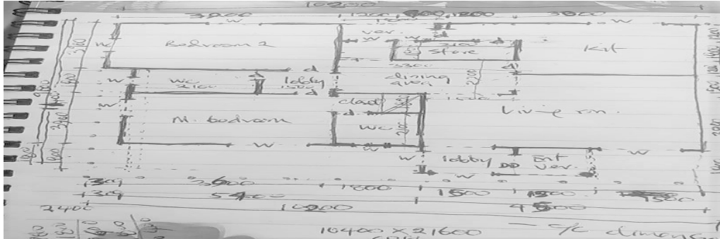
Figure 1: Hand drawn sketch of the floor plan of the two-bedroom unit

This means that the sketch enabled the client and the architect to share or convey complex details about the project.