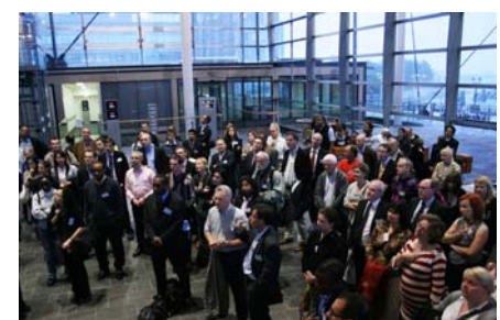
ARCOM 24: Welsh Assembly attracted a lot of interest from the delegates.