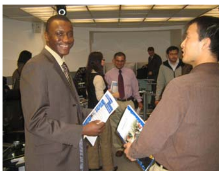
Delegates in discussion.