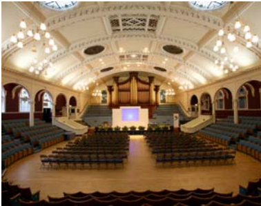
Albert Hall Conference Centre: The Great Hall - main facility for the 25th ARCOM conference