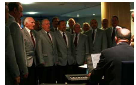
ARCOM 24: Wonderful entertainment with a pinch of tradition.