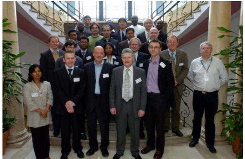
Delegates at the Wolverhampton Doctoral Workshop