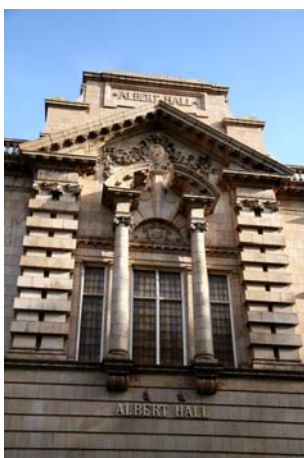
Albert Hall Conference Centre in Nottingham