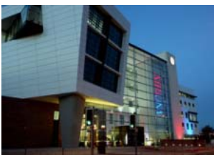
ATRium, the main facility for the 24th ARCOM conference