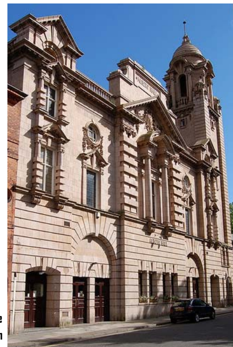
ARCOM 2009: Albert Hall Conference Centre Nottingham