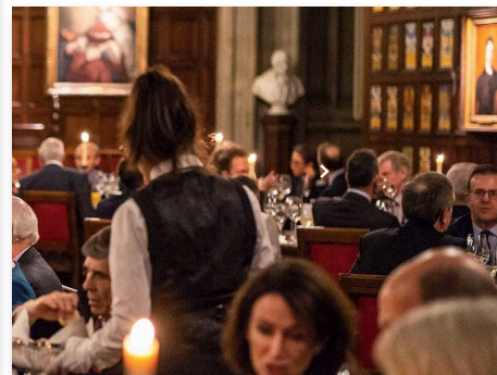
Left to Right: The Great Hall, Lincoln's Inn - The Hub, LSBU – Dining Space, Lincoln's Inn